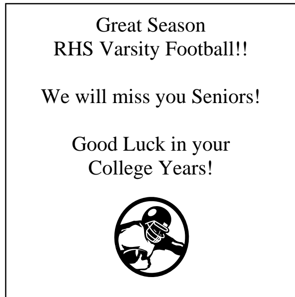
Half page example